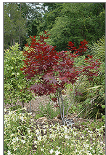
Ed's Red Japanese Maple