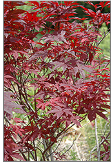
Ed's Red Japanese Maple foliage