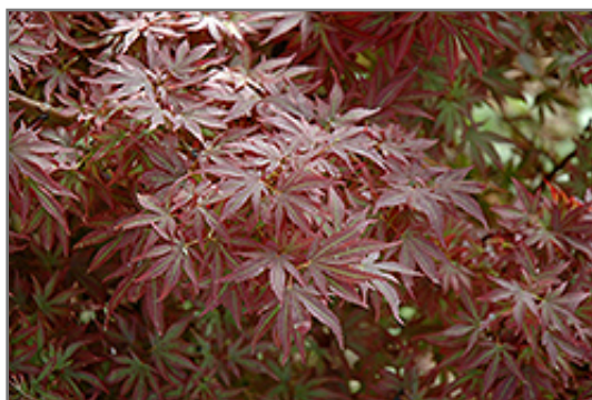
Aratama Japanese Maple foliage