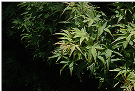
Akita Yatsubusa Japanese Maple foliage