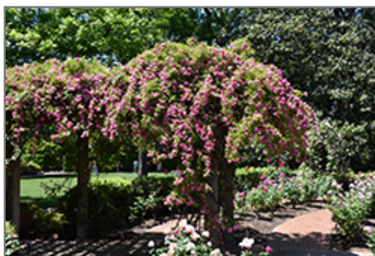
Climbing Pinkie Rose flowers