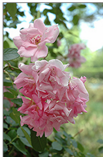
Climbing Pinkie Rose flowers