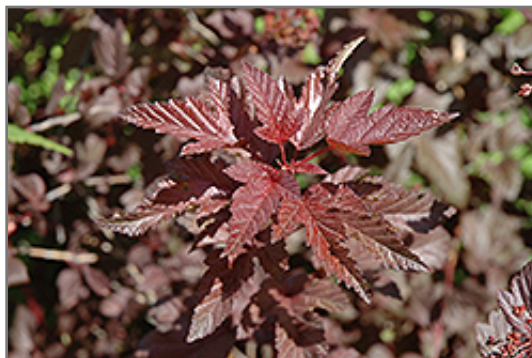
Lady In Red Ninebark foliage