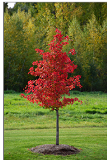
Wildfire Black Gum in fall