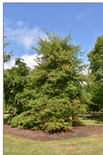
Wildfire Black Gum