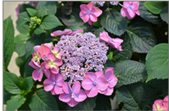
Tuff Stuff Hydrangea flowers

This shrub performs well in both full sun and full shade. However, you may want to keep it away from hot, dry locations that receive direct afternoon sun or which get reflected sunlight, such as against the south side of a white wall. It prefers to grow in average to moist conditions, and shouldn't be allowed to dry out. It is not particular as to soil type, but has a definite preference for acidic soils. It is somewhat tolerant of urban pollution, and will benefit from being planted in a relatively sheltered location. Consider applying a thick mulch around the root zone in winter to protect it in exposed locations or colder microclimates. This is a selected variety of a species not originally from North America.