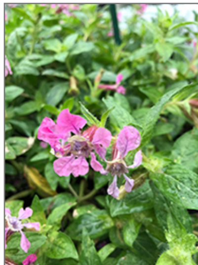
Sriracha Pink Cuphea flowers