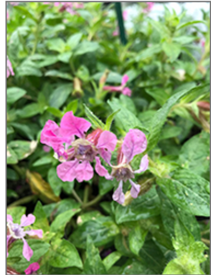
Sriracha Pink Cuphea flowers