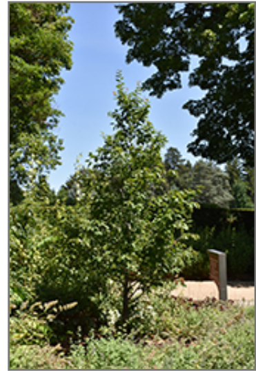
Firespire American Hornbeam

This plant is not reliably hardy in our region, and certain restrictions may apply; contact the store for more information.