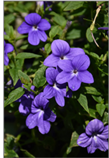
Endless Illumination Browallia flowers