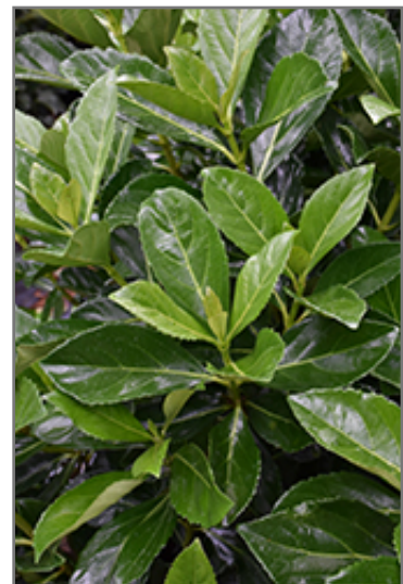
Sweet Viburnum foliage