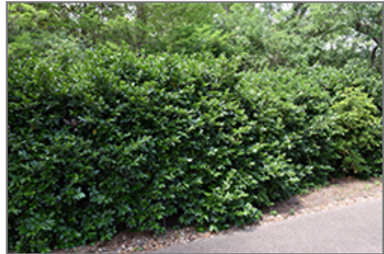
Sweet Viburnum

Sweet Viburnum is recommended for the following landscape applications;