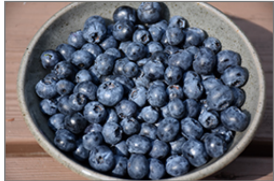
Tifblue Rabbiteye Blueberry fruit

Tifblue Rabbiteye Blueberry features dainty clusters of white bell-shaped flowers with shell pink overtones hanging below the branches in early spring. It has bluish-green deciduous foliage. The glossy oval leaves turn an outstanding red in the fall. It features an abundance of magnificent blue berries from late spring to early summer.