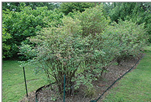
Tifblue Rabbiteye Blueberry

This plant is not reliably hardy in our region, and certain restrictions may apply; contact the store for more information.