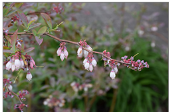
Tifblue Rabbiteye Blueberry flowers