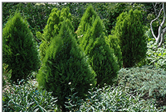
Minima Glauca Arborvitae

Minima Glauca Arborvitae will grow to be about 6 feet tall at maturity, with a spread of 4 feet. It tends to fill out right to the ground and therefore doesn't necessarily require facer plants in front, and is suitable for planting under power lines. It grows at a slow rate, and under ideal conditions can be expected to live for 70 years or more.