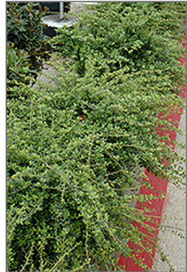
Helleri Japanese Holly

This plant is not reliably hardy in our region, and certain restrictions may apply; contact the store for more information.