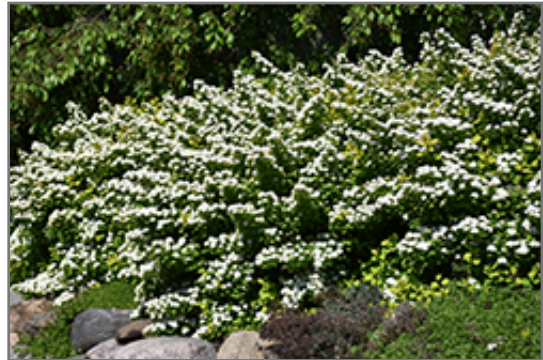
Glow Girl Birch Leaf Spirea in bloom