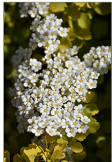
Glow Girl Birch Leaf Spirea flowers