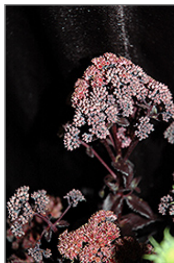
Orbit Bronze Stonecrop flowers