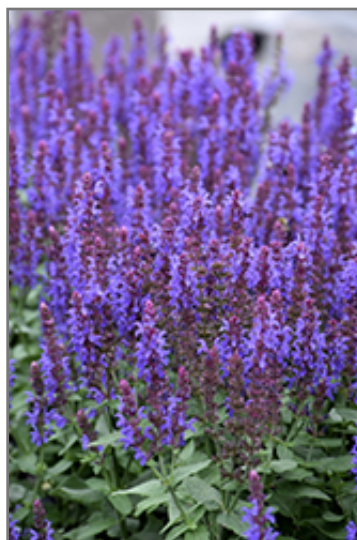
Sensation Sky Blue Meadow Sage flowers