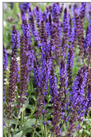
Lyrical Blues Meadow Sage flowers

Lyrical Blues Meadow Sage is recommended for the following landscape applications;