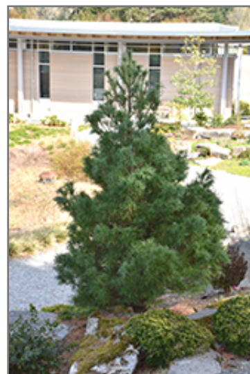
Mini Twists White Pine

Mini Twists White Pine is recommended for the following landscape applications;