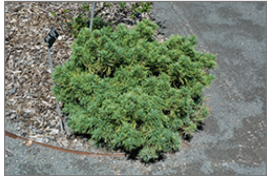
Mini Twists White Pine

This plant is not reliably hardy in our region, and certain restrictions may apply; contact the store for more information.