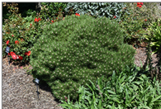
Bambino Dwarf Austrian Pine