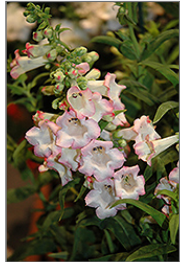
Arabesque Pink Beard Tongue flowers