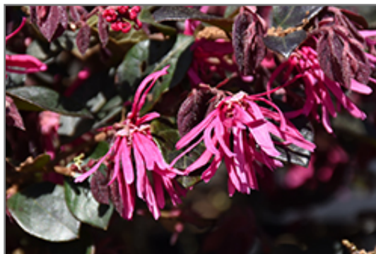
Suzanne Chinese Fringeflower flowers