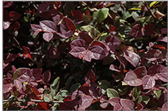
Suzanne Chinese Fringeflower foliage

This plant is not reliably hardy in our region, and certain restrictions may apply; contact the store for more information.