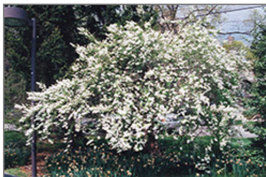
Common Pearlbush in bloom