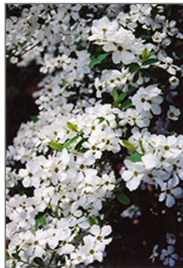
Common Pearlbush flowers

Common Pearlbush will grow to be about 12 feet tall at maturity, with a spread of 10 feet. It tends to be a little leggy, with a typical clearance of 2 feet from the ground, and is suitable for planting under power lines. It grows at a medium rate, and under ideal conditions can be expected to live for approximately 30 years.