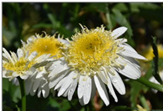
Realflor Real Glory Shasta Daisy flowers

Realflor Real Glory Shasta Daisy is recommended for the following landscape applications;