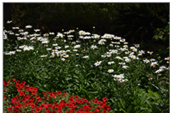
Brightside Shasta Daisy in bloom