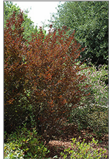
Cherry Dazzle Crapemyrtle

This plant is not reliably hardy in our region, and certain restrictions may apply; contact the store for more information.