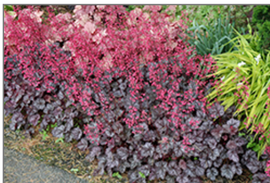
Glitter Coral Bells in bloom

Glitter Coral Bells is recommended for the following landscape applications;