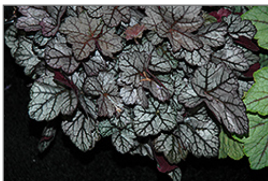
Glitter Coral Bells foliage