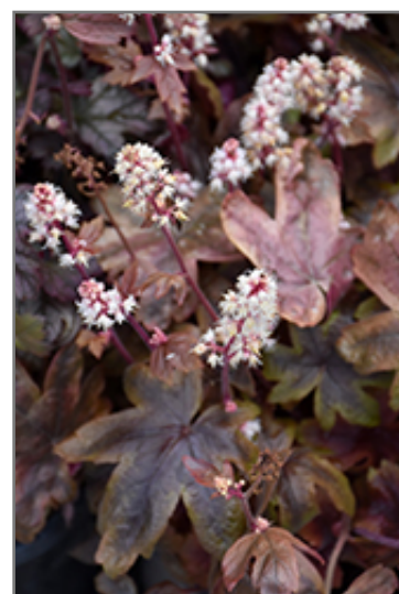
Brass Lantern Foamy Bells flowers