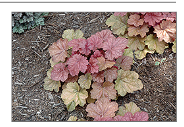
Kira Tundra Coral Bells foliage