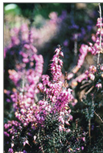
Furzey Heath flowers