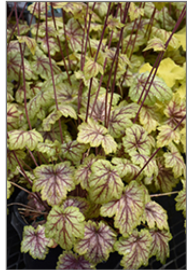
Circus Coral Bells foliage