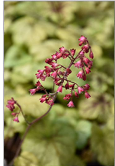
Circus Coral Bells flowers

This plant is not reliably hardy in our region, and certain restrictions may apply; contact the store for more information.