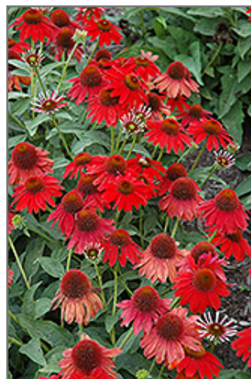
Sombrero Salsa Red Coneflower flowers

Sombrero Salsa Red Coneflower is recommended for the following landscape applications;