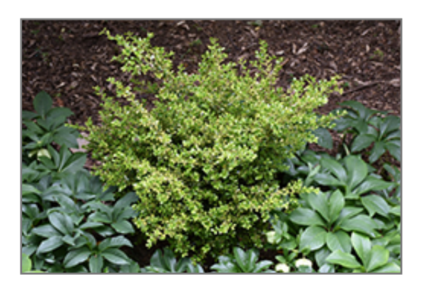
Golden Dream Boxwood

Golden Dream Boxwood is a dense multi-stemmed evergreen shrub with a mounded form. It lends an extremely fine and delicate texture to the landscape composition which should be used to full effect.