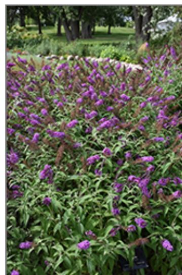
Buzz Purple Butterfly Bush in bloom