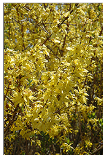
Spring Glory Forsythia flowers