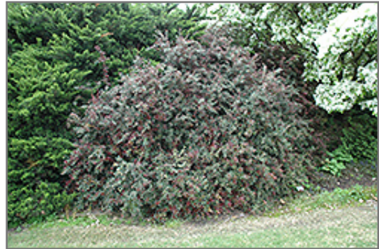
Spring Glory Wintergreen Barberry

Spring Glory Wintergreen Barberry is recommended for the following landscape applications;