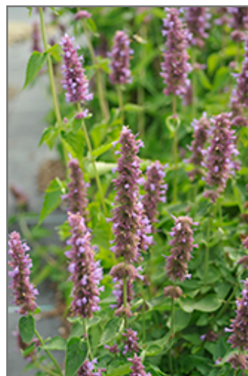
Blue Boa Hyssop flowers