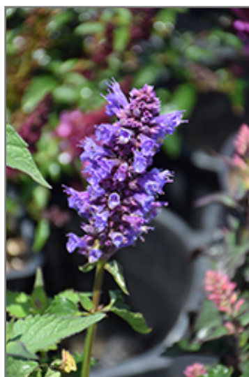
Blue Boa Hyssop flowers