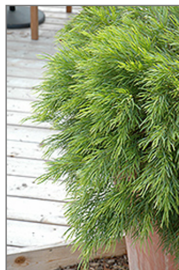
Cousin Itt Little River Wattle foliage