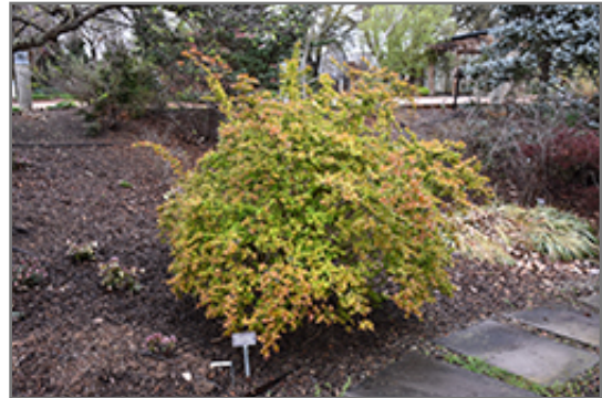
Canyon Creek Abelia

This shrub will require occasional maintenance and upkeep, and should only be pruned after flowering to avoid removing any of the current season's flowers. It is a good choice for attracting birds, bees and butterflies to your yard, but is not particularly attractive to deer who tend to leave it alone in favor of tastier treats. It has no significant negative characteristics.