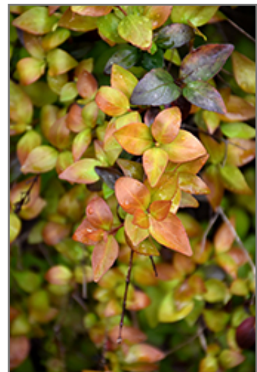
Canyon Creek Abelia foliage