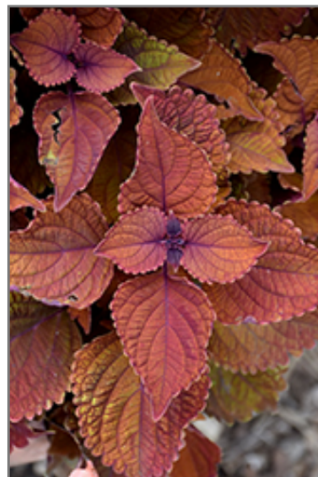
Wall Street Coleus foliage