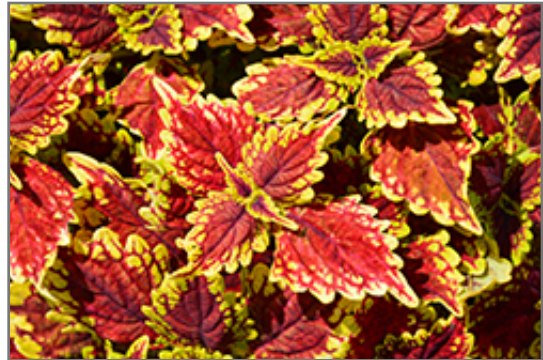
Oxford Street Coleus foliage