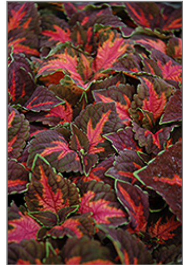
Superfine Rainbow Festive Dance Coleus foliage