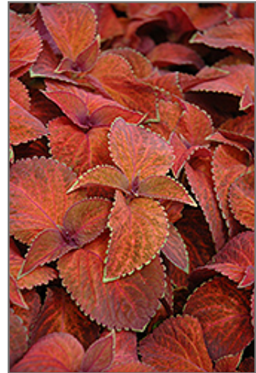
Wizard Sunset Coleus foliage

Wizard Sunset Coleus is recommended for the following landscape applications;