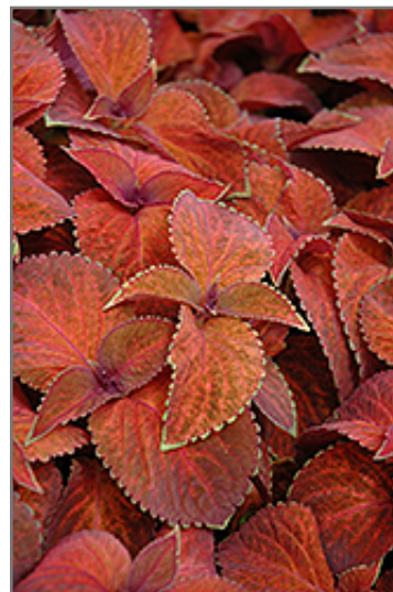
Wizard Sunset Coleus foliage

Wizard Sunset Coleus is recommended for the following landscape applications;