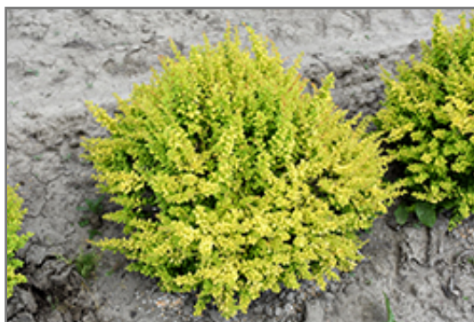
Sunsation Japanese Barberry