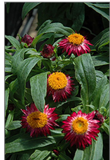
Mohave Dark Red Strawflower flowers