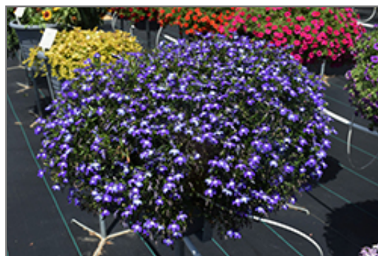
Magadi Compact Blue Plus Eye Lobelia in bloom