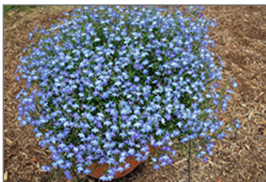
Bella Cielo Lobelia in bloom