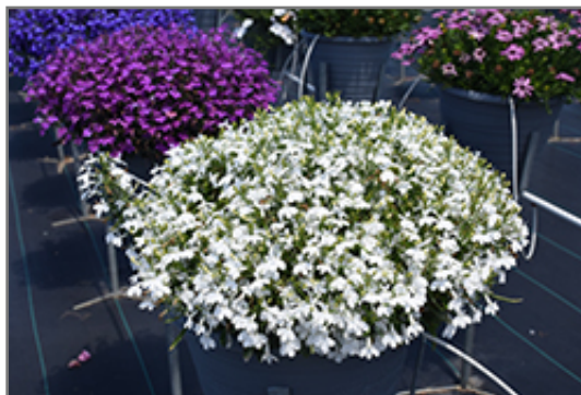
Techno Upright White Lobelia in bloom

Techno Upright White Lobelia is a fine choice for the garden, but it is also a good selection for planting in hanging baskets. Because of its trailing habit of growth, it is ideally suited for use as a 'spiller' in the 'spiller-thriller-filler' container combination; plant it near the edges where it can spill gracefully over the pot. Note that when growing plants in outdoor containers and baskets, they may require more frequent waterings than they would in the yard or garden.