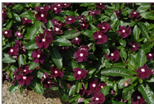
Jams 'N Jellies Blackberry Vinca flowers

Jams 'N Jellies Blackberry Vinca is recommended for the following landscape applications;