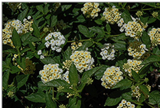
Denholm White Lantana flowers